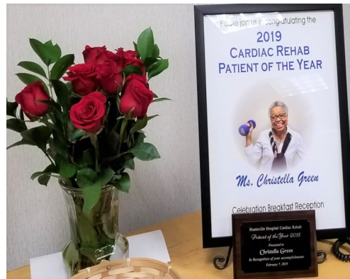
Huntsville Hospital Award