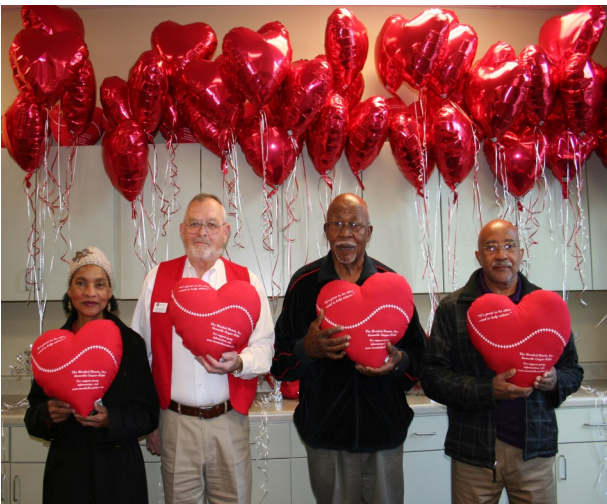
Mended Hearts Volunteers